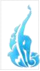
FIG RHYTHMIC GYMNASTICS WORLD CHALLENGE CUP KAZAN (RUS) 11 – 13 AUGUST 2017 INDIVIDUAL AND GROUP